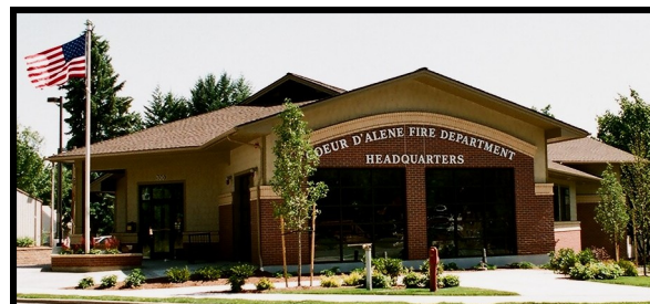
Coeur d'Alene Fire Department Headquarters