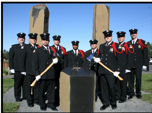
Heroes Plaza Honor Guard